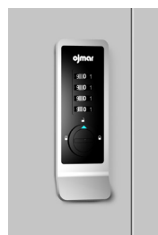
Mechanical Square Front