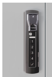
Nano E-Lock Mini Keypad (WE)