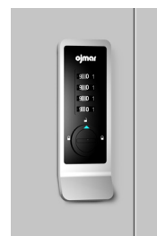
Mechanical Square Front