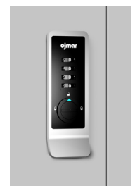
Mechanical Square Front