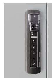
Nano E-Lock Mini Keypad (WE)