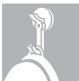
2-Prong Coat Hooks