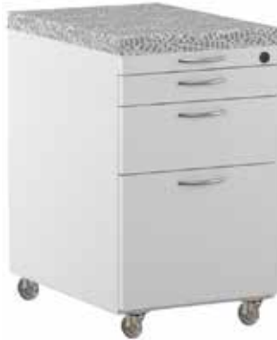
Pencil/Box/File, translucent casters

*Not all product configurations shown; see bottom right specifications for all available options