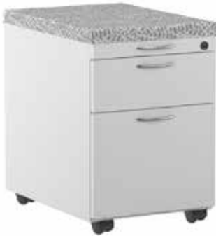
Box/File, black casters