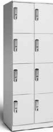
Cubby Locker 8 door