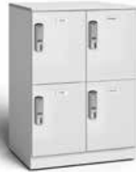
Cubby Locker 4 door with Embossed label holder