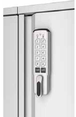
Close Up of Electronic Lock on an "A" Full Pull Front; Hinge Location Right