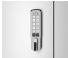
E: Integrate Lock Pull