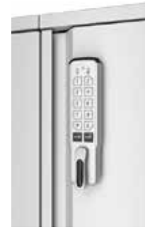
Close Up of Electronic Lock on an "A" Full Pull Front; Hinge Location Right