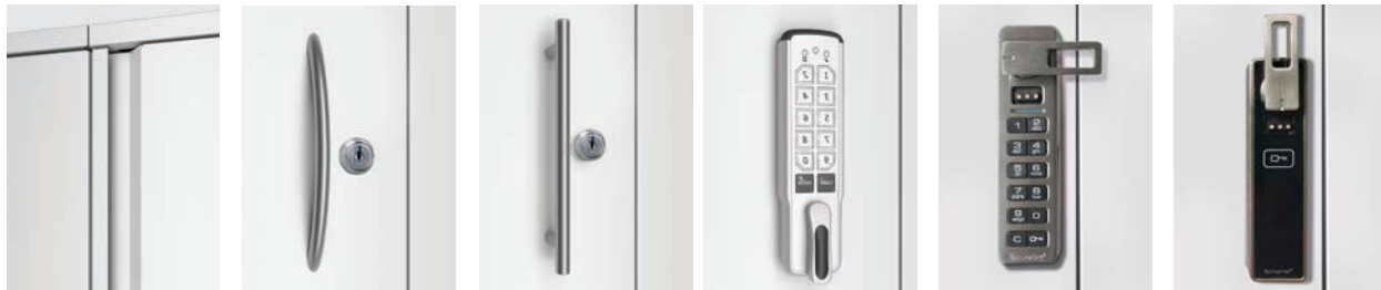
A – Full Pull

When specifying E-lock Mini or E-Lock RFID, Programming and Managers Keys are required to operate these locks. See price book to order these key management accessories.