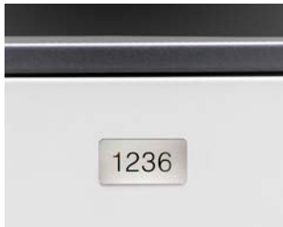
Door Number Plates