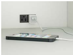
Interior Power Outlet