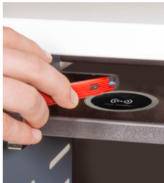
Optional Wireless Charging