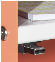
Magnetic Touch Latch