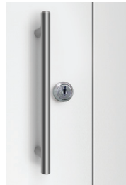
Q - Bar Pull Square Front