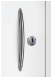
S - Satin Nickel Loop Pull Square Front