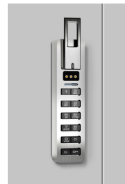
E-Lock Mini Keypad Square Front or A-Full Pull