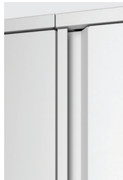
A - Full Pull

When specifying E-lock Mini or E-Lock RFID, Programming and Managers Keys are required to operate these locks. See page 57 of the pricebook online to order these key management accessories.