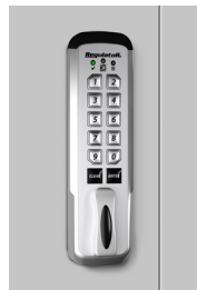
E-Lock Square Front or A-Full Pull