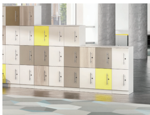
Multi Color Door Fronts: Visit our website for details