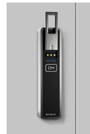
E-Lock Mini RFID Square Front or A-Full Pull