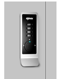
Mechanical Square Front or A-Full Pull