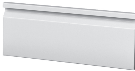
A: Full Pull