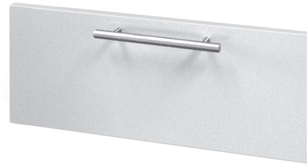
Q: Square, Satin Nickel Bar Pull