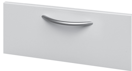
S: Square, Satin Nickel Loop Pull (Add "B" suffix for black pull)