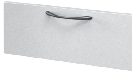
Y: Square, Black Wire Pull